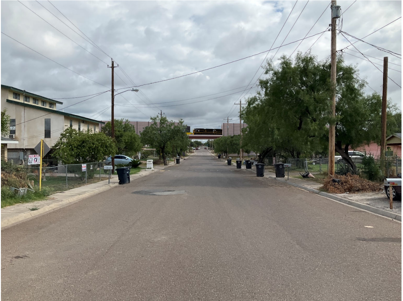
Figure M-3. KOP 3 After Construction of the Southern Rail Alternative (Approximately 350 Feet from Viewpoint)